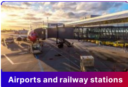
Airports and railway stations