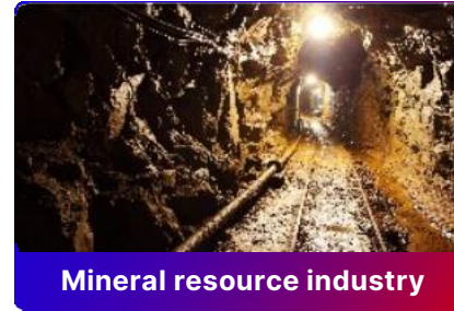
Mineral resource industry