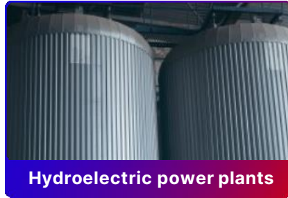
Hydroelectric power plants