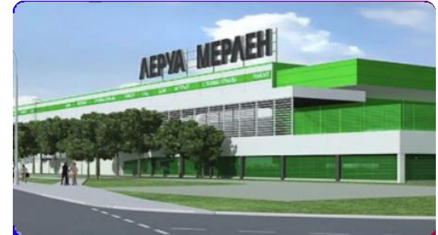
Non-food oriented retail