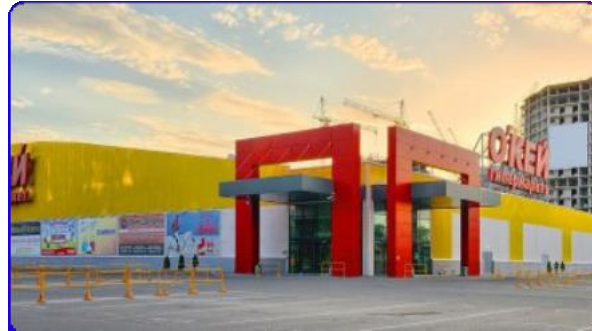
Food oriented retail