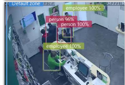
Facial recognition Uniform color

It uses object tracking mechanism to count unique objects and analyze movements.