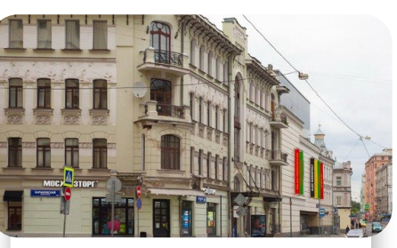
Buildings and facilities